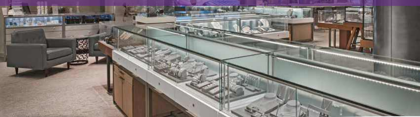
Tapper's Diamonds & Fine Jewelry