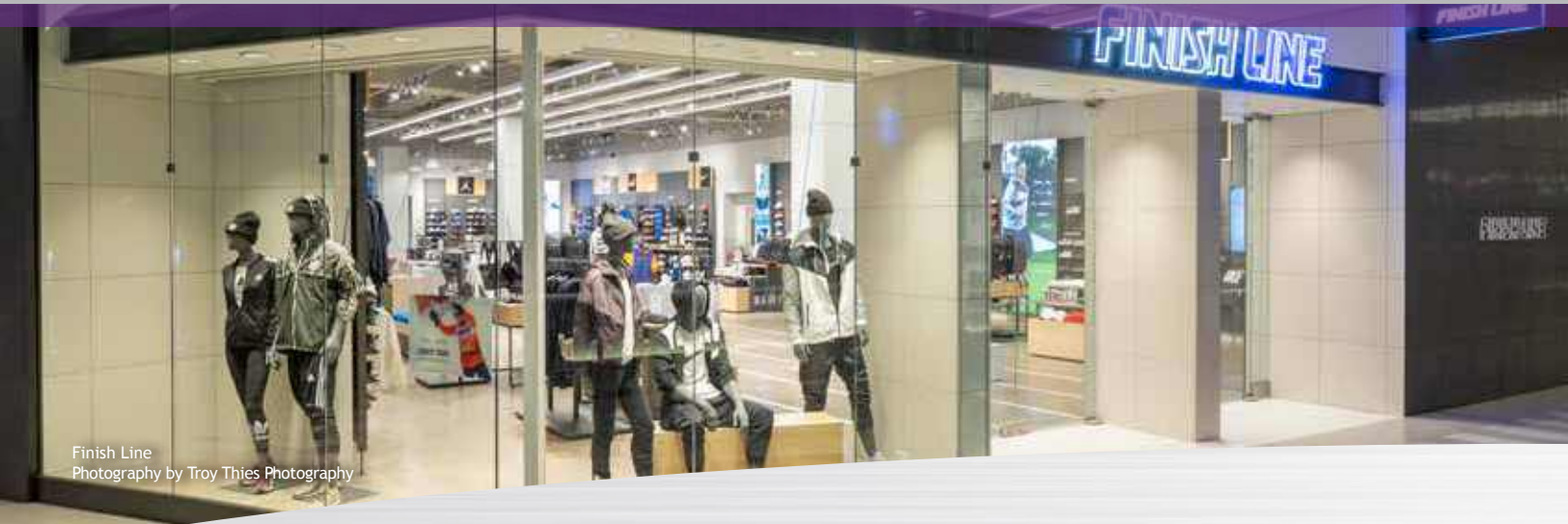
Finish Line

Stylmark provides solutions for commercial interior environments from retail and hospitality to out-of-home advertising. Stylmark, a leading U.S. manufacturer of aluminum fixtures, creates showcases, fitting rooms, LED lighting systems & light boxes, mirrors, shelving and trimwork anodized to an array of colors. For over 60 years, Stylmark continues to enhance the functionality and aesthetics of interiors for the world's largest brands.