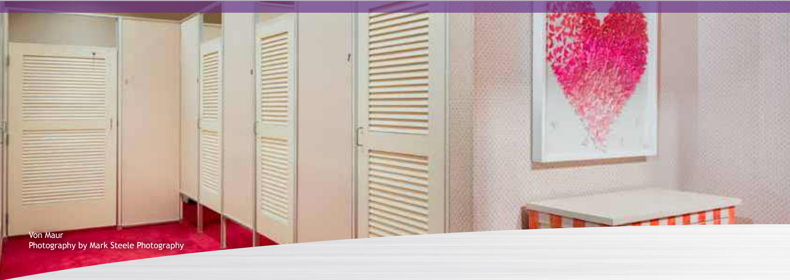
Von Maur