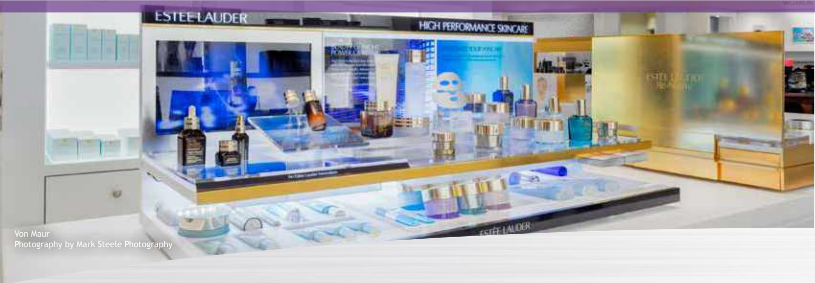
Von Maur